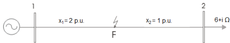
Figure 1: Fault on a transmission line

Calculate the subtransient short circuit currents on both sides in case of a three phase fault at point F, using the superposition technique .